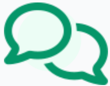
Web Chat Widget