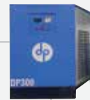
Refrigerated Air Dryer