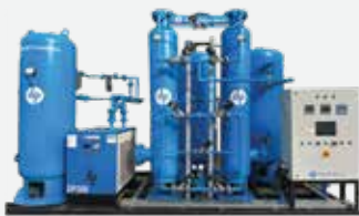
DPNI / DPOX Series

Nitrogen Generator Capacity: 5 - 300 Nm 3 /Hr Purity: 99 - 99.999% Oxygen Generator Capacity: 5 - 60 Nm 3 /Hr Purity: 93% +/-2